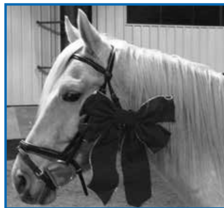
Doc, who participated in the Lexington Mounted Police Civilian Sensory Course, is one of the newest members of CKRH’s equine team.