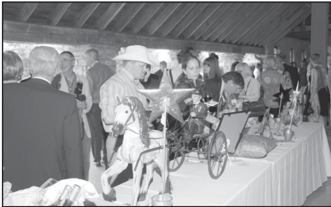
Guests were intrigued by the unique auction items.