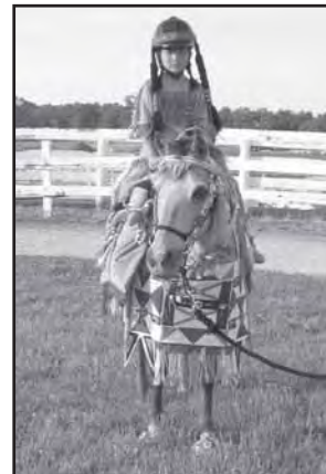
Bibi as Sacajawea on Socialite