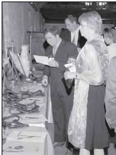
Which famous horse halter should I choose?