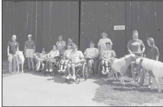
The minis loved being part of this great group!

Games were played such as dress-up relay. During this fast pace relay race, competitors would lead their mini