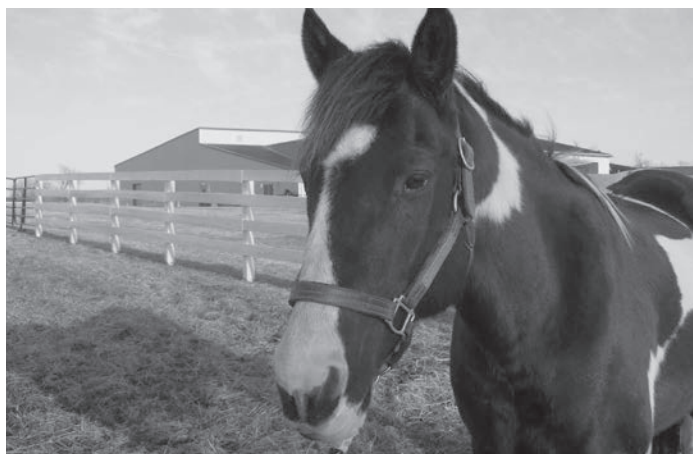
Rhett Butler, our 11-year-old paint gelding.